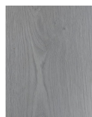
Luna Grey XL